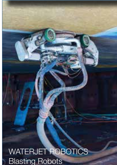
WATERJET ROBOTICS Blasting Robots

For more information about GBSL services visit www.grandbahamashipyard.com