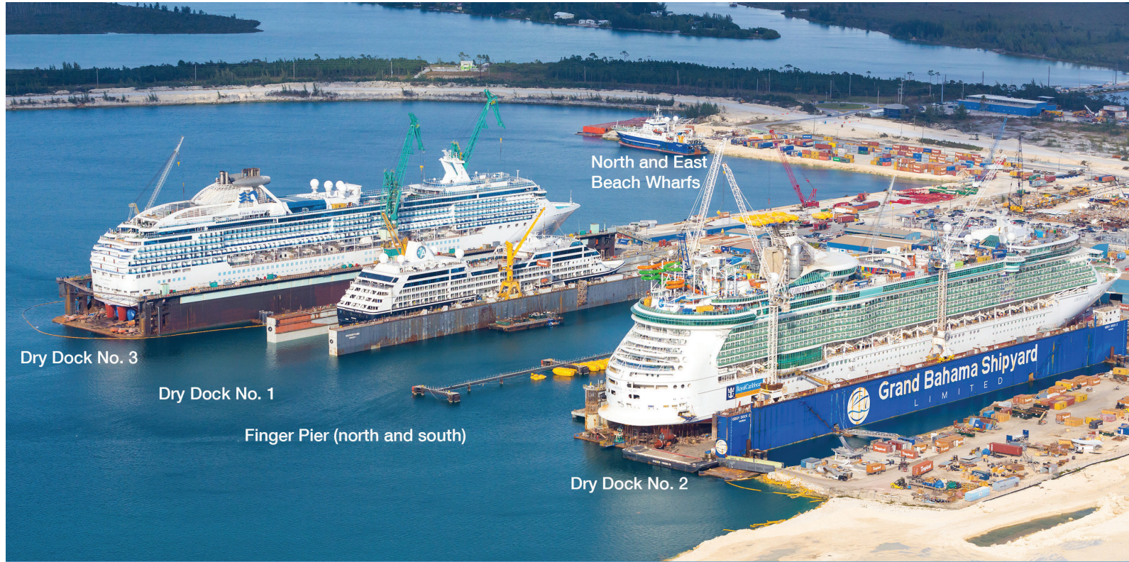
North and East Beach Wharfs